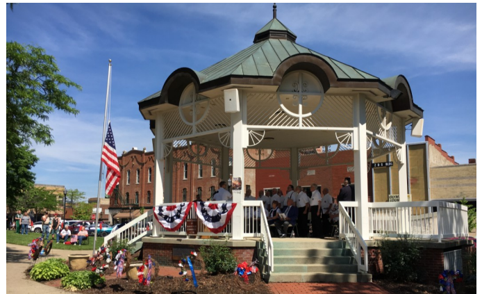
The Chordsmen perform in the gazebo on the square in downtown Mansfield, during the Memorial Day ceremony.

As has been the custom for the past many years, the Fun Center Chordsmen again participated in the Mansfield Memorial Day ceremony. The Chordsmen have been a part of this ceremony for years when it was held at the Mansfield Cemetery.